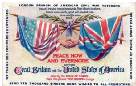
Postcard issued by the London Branch of American Civil War Veterans c1910