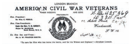
Notepaper of the London Branch of American Civil War Veterans, 1916