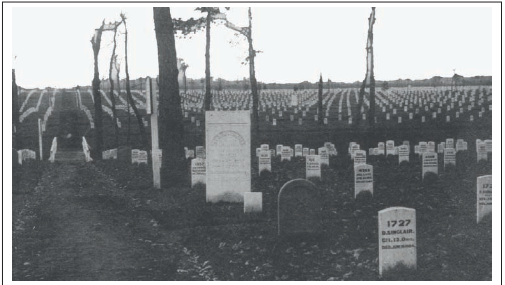
The aftermath of the American Civil War – an early view of one of the cemeteries where the 600,000 dead of the war were buried.

It is fortuitous that these three men rest in Highgate Cemetery, to remind us of this dramatic era of world history. It is not impossible that others remain to be identified there, and perhaps one day we will be able to balance up Highgate's part in telling the story of those turbulent times, with the discovery of the grave of a man who fought in the Confederate Army.